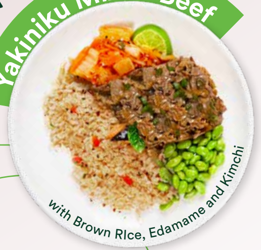
with Brown Rice, Edamame and Kimchi