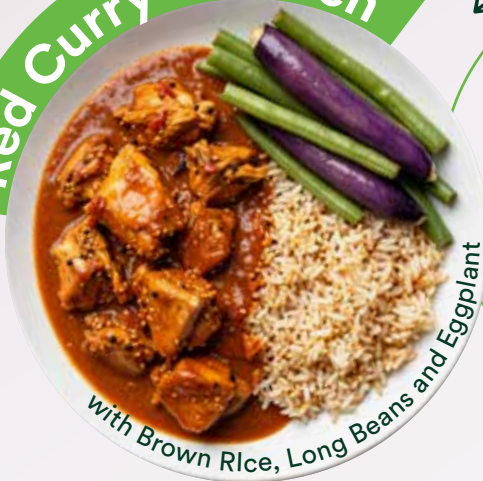
with Brown Rice, Long Beans and Eggplant