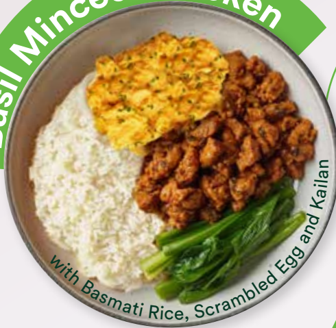
with Basmati Rice, Scrambled Egg and Kailan