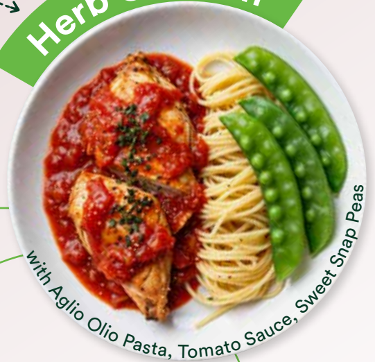
With Aglio Olio Pasta, Tomato Sauce, Sweet Snap Peas