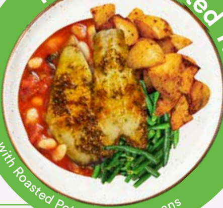
with Roasted Potato, French Beans