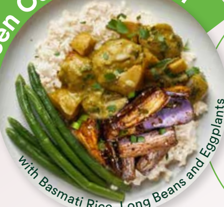
With Basmati Rice, Long Beans and Eggplants

Large Plan 660kcal 52g 64g 22g Calories Protein Carbs Fat