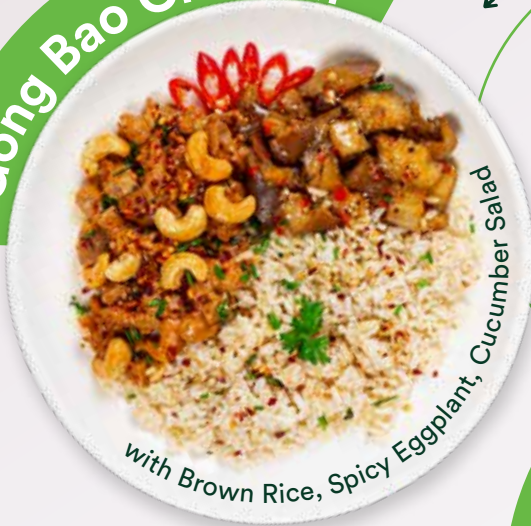
with Brown Rice, Spicy Eggplant, Cucumber Salad

Large Plan 675kcal Calories 52g Protein 68g Carbs 22g Fat