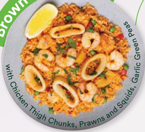
With Chicken Thigh Chunks, Prawns and Squids, Garlic Green Peas