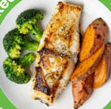
with Cajun Roasted Sweet Potato, Broccoli