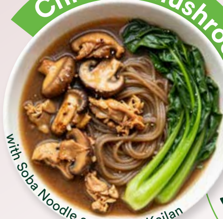
with Soba Noodle and Garlic Kailan

Large Plan 600kcal Calories 48g Protein 59g Carbs 19g Fat