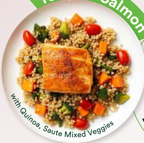
with Quinoa, Saute Mixed Veggies