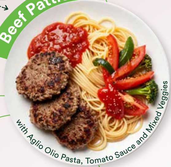
With Aglio Olio Pasta, Tomato Sauce and Mixed Veggies