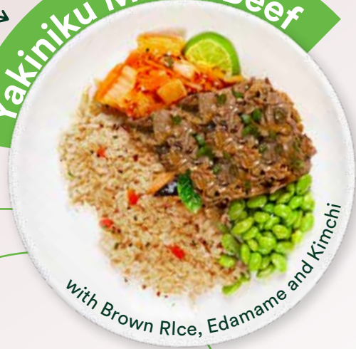
with Brown Rice, Edamame and Kimchi

Large Plan 670kcal Calories 52g Protein 67g Carbs 22g Fat