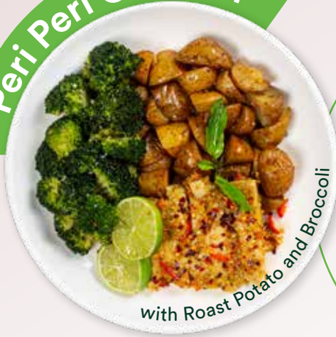
with Roast Potato and Broccoli