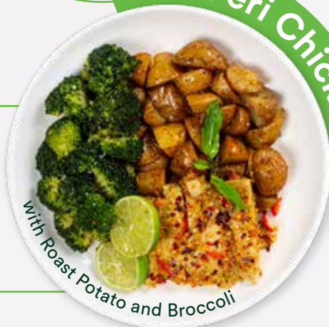
With Roast Potato and Broccoli

Large Plan 610kcal 54g 62g 17g Calories Protein Carbs Fat