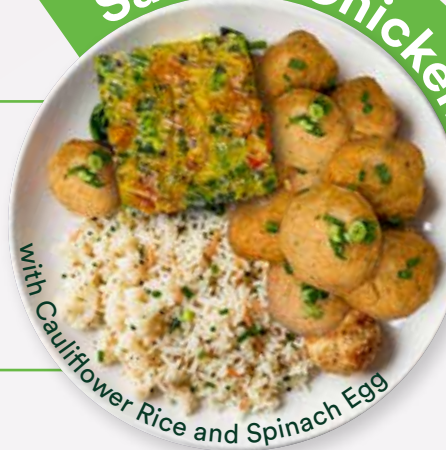
with Cauliflower Rice and Spinach Egg