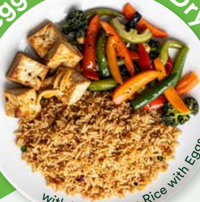
With Fried Brown Rice with Eggs