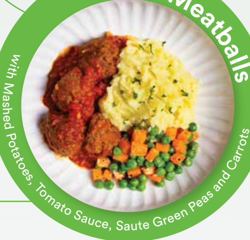
With Mashed Potatoes, Tomato Sauce, Saute Green Peas and Carrots