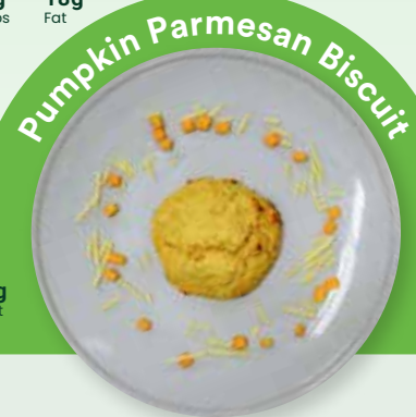
Pumpkin Parmesan Biscuit

135kcal 3g 15g 7g Calories Protein Carbs Fat