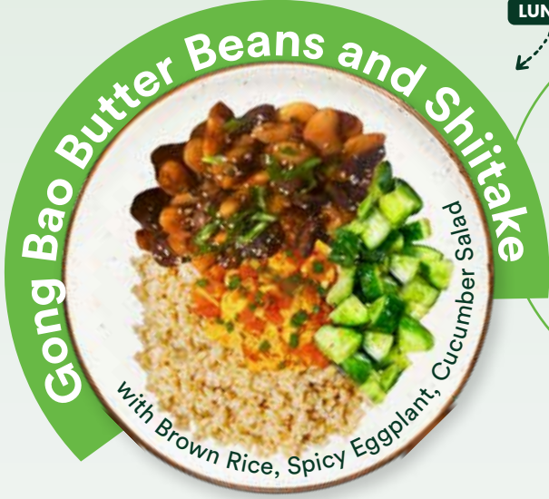
Gong Bao Butter Beans and Shitake with Brown Rice, Spicy Eggplant, Cucumber Salad