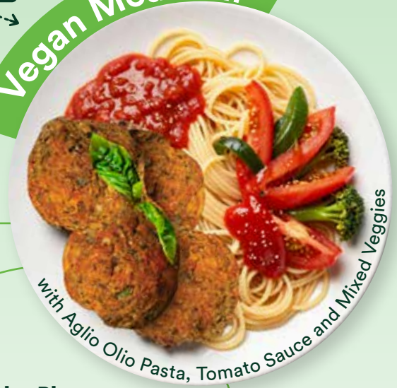
With Aglio Olio Pasta, Tomato Sauce and Mixed Veggies