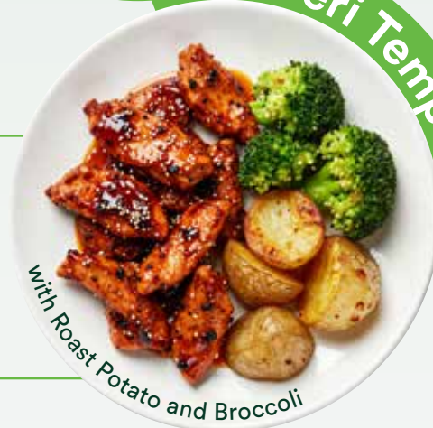
With Roast Potato and Broccoli