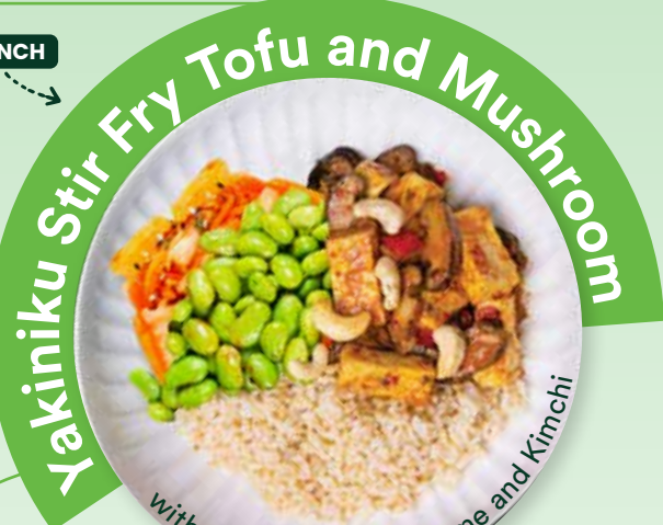
Yakiniku Stir Fry Tofu and Mushroom with Brown Rice, Edamame and Kimchi