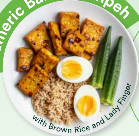
With Brown Rice and Lady Finger