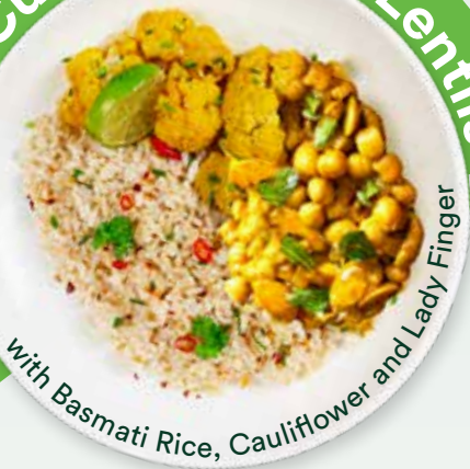
With Basmati Rice, Cauliflower and Lady Finger