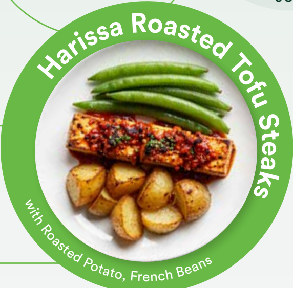
Harissa Roasted Tofu Steaks with Roasted Potato, French Beans

565kcal 44g 51g 21g Calories Protein Carbs Fat