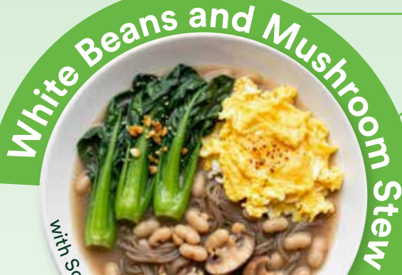
White Beans and Mushroom Stew with Soba Noodle and Garlic Kailan

575kcal 42g 62g 18g Calories Protein Carbs Fat