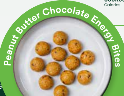
Peanut Butter Chocolate Energy Bites