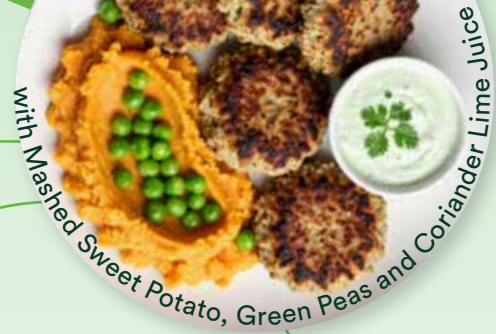
With Mashed Sweet Potato, Green Peas and Coriander Lime Juice