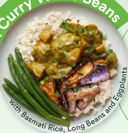
With Basmati Rice, Long Beans and Eggplants