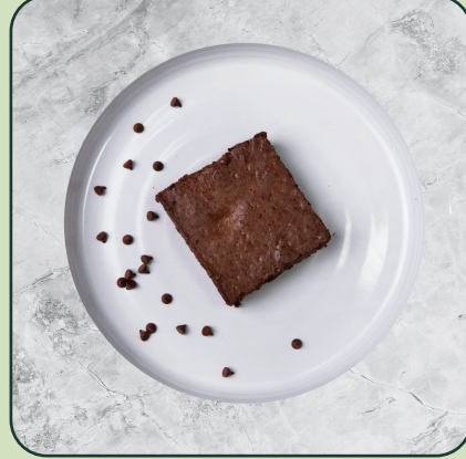
Tofu Chocolate Brownie (100g) $4.50 - 258cal