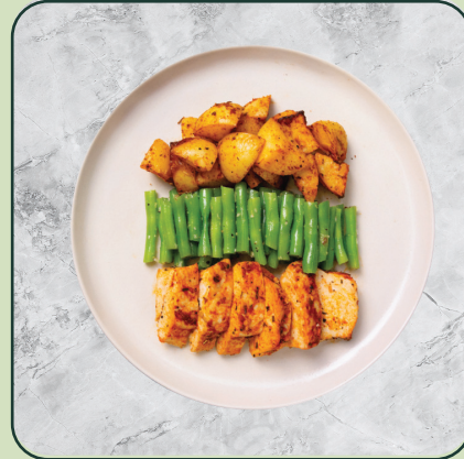
Herb Chicken with Roasted Potatoes, French Beans and Harissa Sauce (445g) $14.00 - 481cal