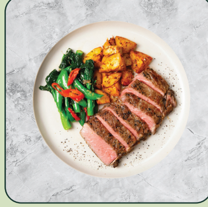
Beef Steak with Sauteed Kailan and Snap Peas (430g) $19.00 - 616cal