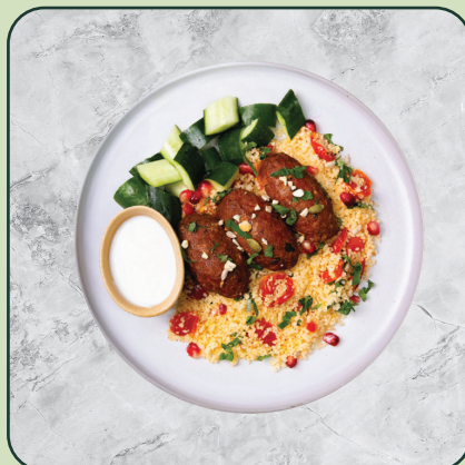
Lamb Kofta with Couscous, Cucumber Mint Yoghurt and Pomegranate (415g) $18.00 - 581cal