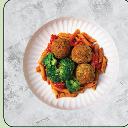
Vegan Meatballs with Wholemeal Pasta, Tomato Sauce, Broccoli (490g) $13.00 - 581cal