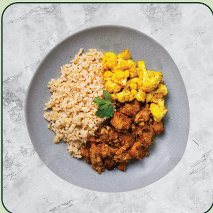
Rendang Chicken with Brown Rice and Curry Roasted Cauliflower (480g) $14.00 - 477cal