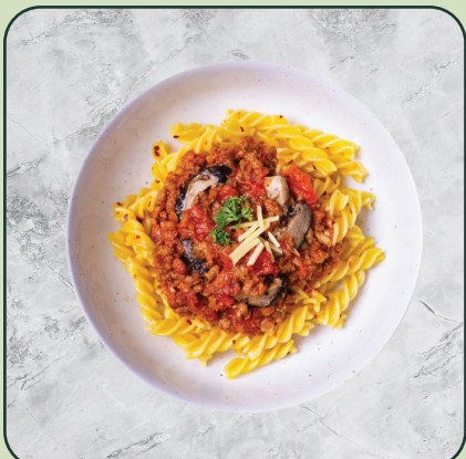
Beef Bolognese Pasta with Mushrooms Ragout (430g) $14.00 - 547cal