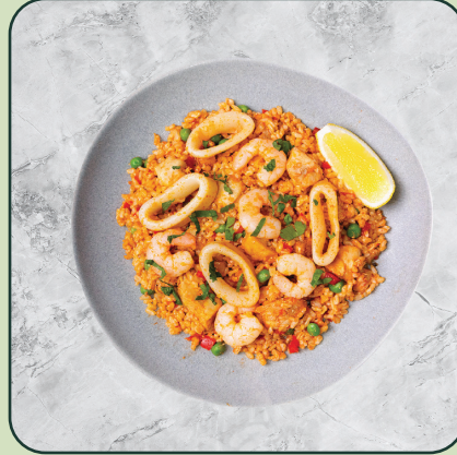
Brown Rice Chicken Paella with Prawns, Squids and Green Peas (504g) $17.00 - 531cal