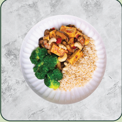
Yakiniku Stir Fried Tofu with Brown Rice, Broccoli and Red Chilli (470g) $13.00 - 516cal