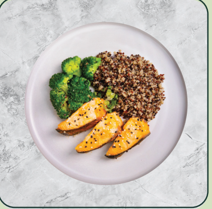
Honey Miso Salmon with Quinoa and Broccoli (420g) $19.00 - 480cal