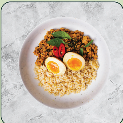
Basil Minced Chicken with Brown Rice and Soy Eggs (430g) $13.00 - 468cal