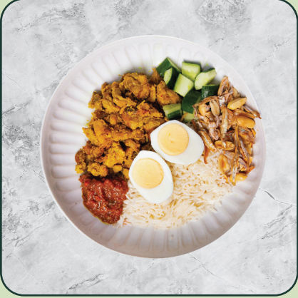
Nasi Lemak with Coconut Basmati Rice, Cucumber and Egg (500g) $15.00 - 511cal