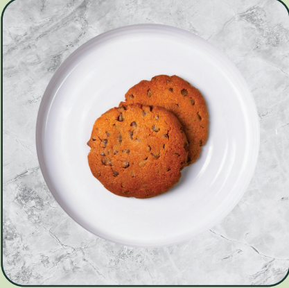
Peanut Butter Chocolate Cookie (40g) $3.00 - 270cal