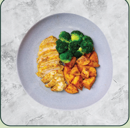
Peri Peri Chicken Breast with Roasted Potatoes and Broccoli (425g) $15.00 - 504cal