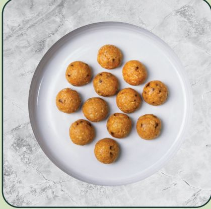
Peanut Butter Chocolate Energy Bites (2 pcs) (6 pcs) $5.50 - 342cal