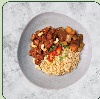
Gong Bao Chicken with Brown Rice and Eggplants (485g) $15.00 - 515cal