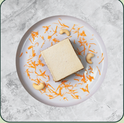
Carrot Cake with Cashew Frosting (100g) $5.90 - 326cal