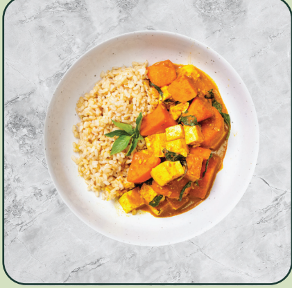
Vegan Peranakan Curry with Brown Rice (505g) $13.00 - 525cal