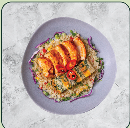
Cauliflower Rice with Herb Chicken and Spinach Eggs (475g) $13.00 - 320cal