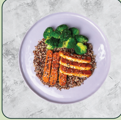
Honey Miso Tempeh with Quinoa and Broccoli (410g) $15.00 - 521cal