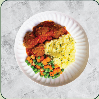
Beef Meatballs with Mashed Potatoes and Sauteed Veggies (495g) $14.00 - 577cal